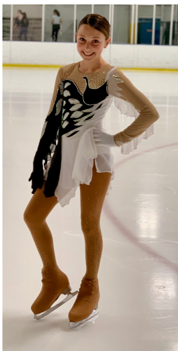
Leia (No Test)