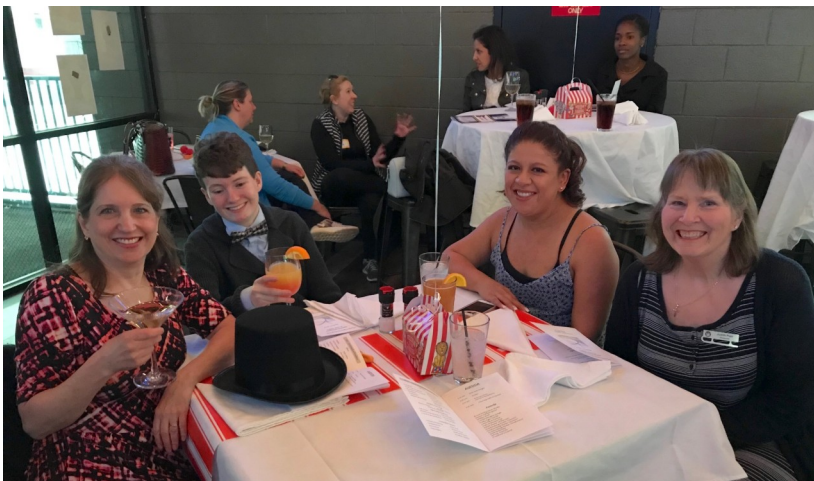
& C A S T P A R T Y