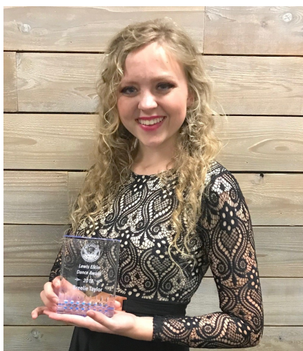
Lewis Elkin Dance Award