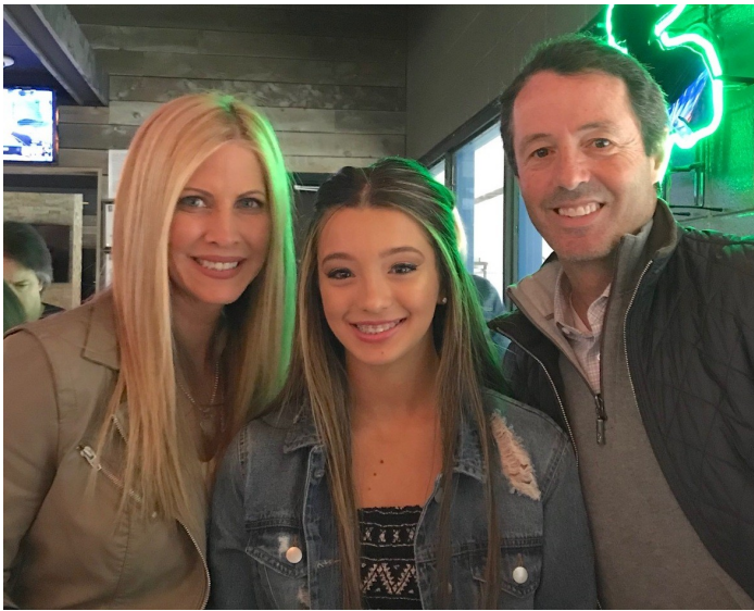
A W A R D S