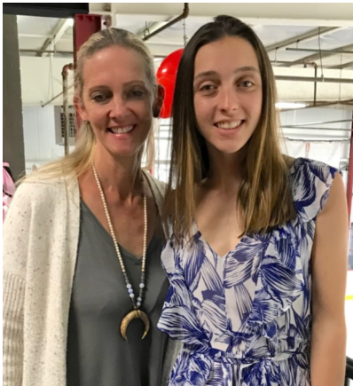
B A N Q U E T