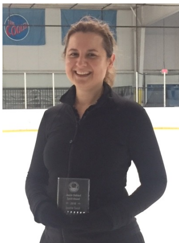
Joann Oehlert Spirit Award