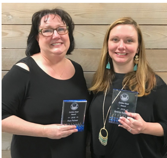
Golden Boot Award