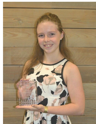
Outstanding Skater - Freshman