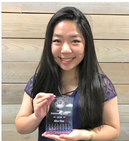
Outstanding Skater - Senior