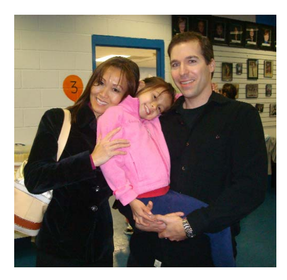
The Freestyler in <u>color</u> is online at atlantafsc.org.